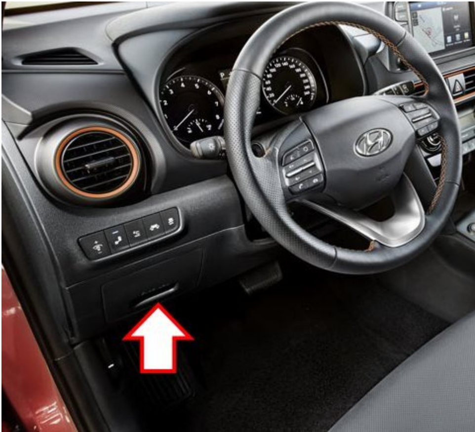
Left-hand drive cars.