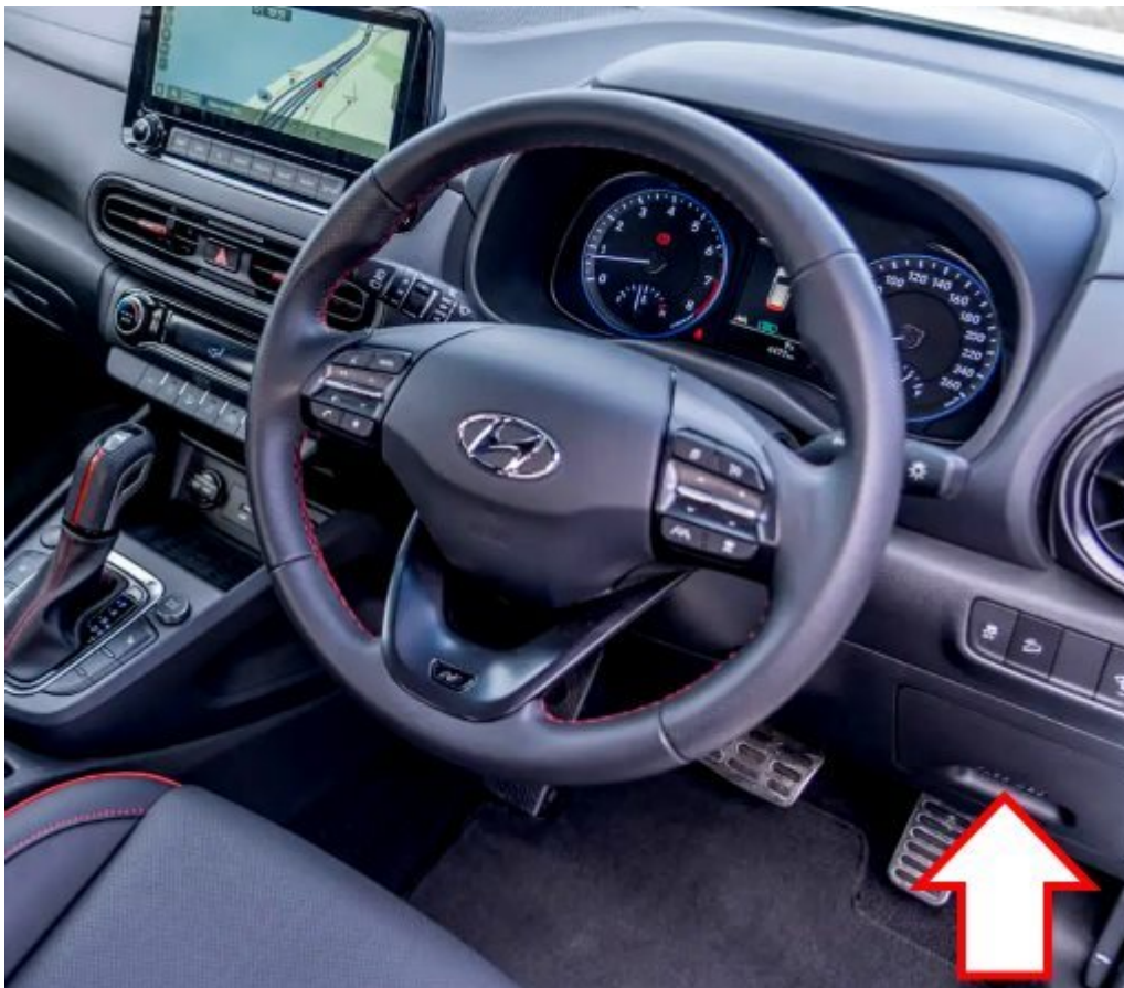
Right-hand drive cars.